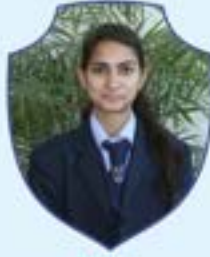
VRITTI 7th Position in KUK