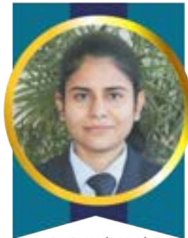
SAGUN (MBA) Axis Bank