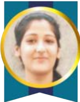
TAMANA (BBA) Tourist Book Pvt. Ltd.