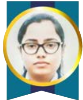
VANADAN (MBA) AXIS BANK