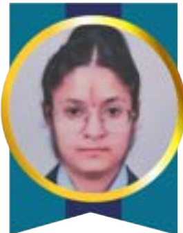
CHERRY (MBA) Axis Bank