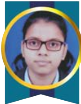
PARKHI (MBA) Tourist Book Pvt. Ltd.