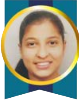
SRISHTI (BBA) Tourist Book Pvt. Ltd.

SDIMT Placement cell seeks to provide experience of the corporate world to students for enhancing their conceptual & analytical skills to communicate with dynamic global world.