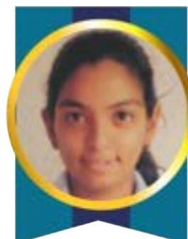
DRISHTI (BCA) Sisfy Technology Lead Origin