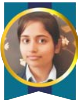
KARISHMA (BCA) Trigent Solution