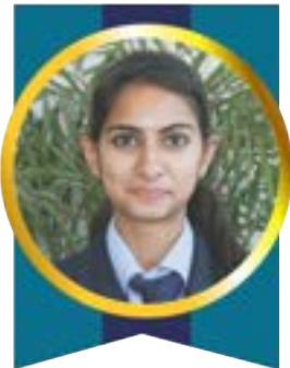
VRITI (MBA) Lead Origin